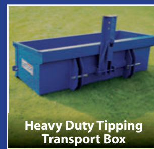
Heavy Duty Tipping Transport Box