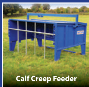
Calf Creep Feeder