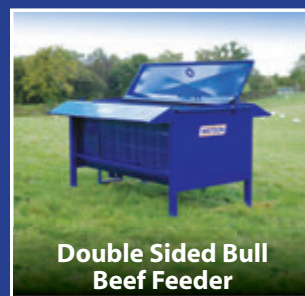
Double Sided Bull Beef Feeder