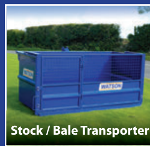
Stock / Bale Transporter