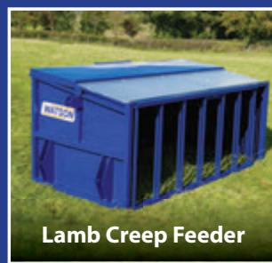
Lamb Creep Feeder