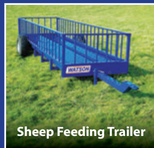
Sheep Feeding Trailer