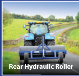
Rear Hydraulic Roller