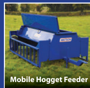
Mobile Hogget Feeder