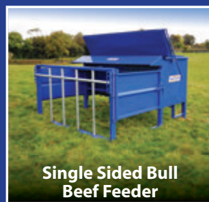
Single Sided Bull Beef Feeder