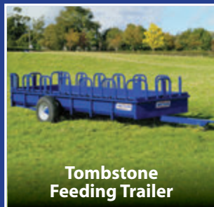
Tombstone Feeding Trailer